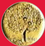
JAPAN QUALITY MEDAL 2007