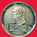
DEMING PRIZE 2003